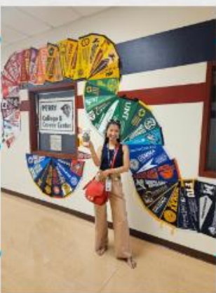
Kim Kwong Career Center